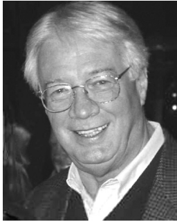
Tibor Machan, Philosopher & Libertarian (1939- )