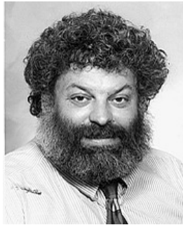
R. Edward Freeman, Philosopher and Professor of Business (1951- )