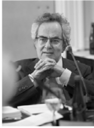
Thomas Nagel (1937- )